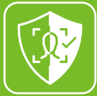
New Height of Anti-Spoofing